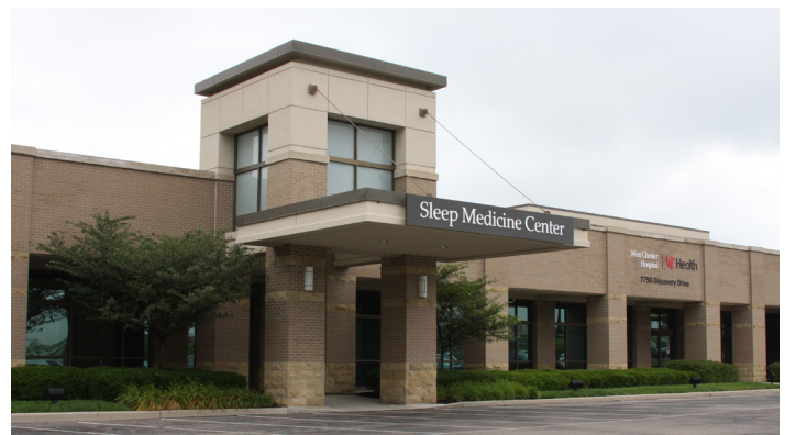
Sleep Studies location

On July 1, 2013, renamed from University Pointe Surgical Hospital