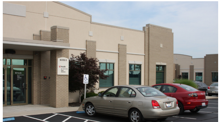
Outpatient Practice location

Two Locations on the West Chester Campus. The Sleep Studies location can be entered on the left entrance of the West Chester Hospital Surgical Center and the Outpatient practice is located in the condominium area to the East of UC Health Physicians Office North.